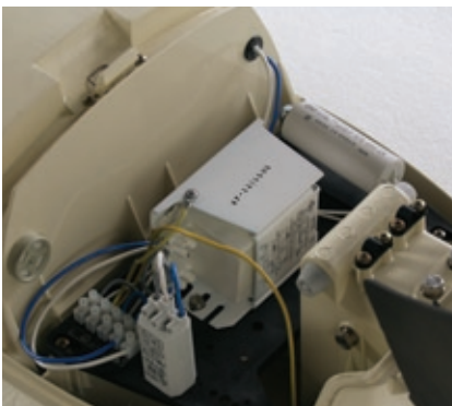
Quick Release Gear